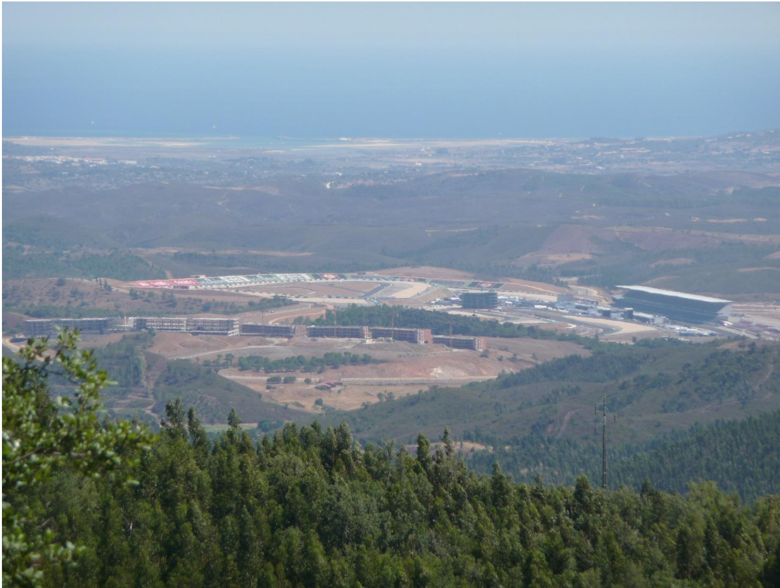
Algarve International Race Track as seen from Monchique Natura 2000 Zone.